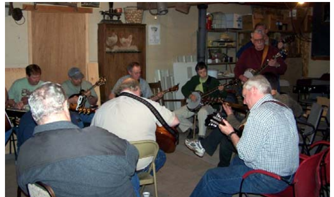
Middle Zone February Jam